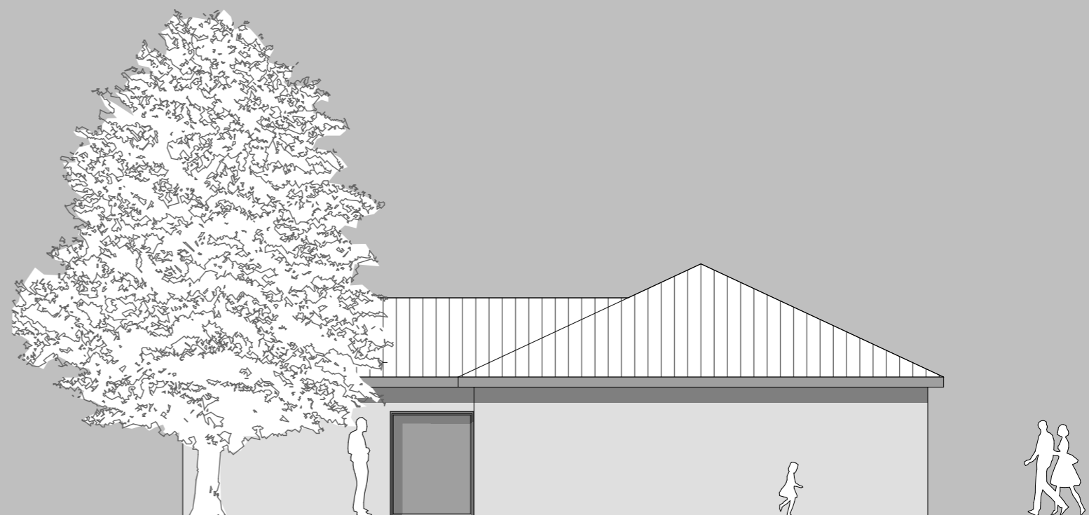
FACADE LATERALE GAUCHE